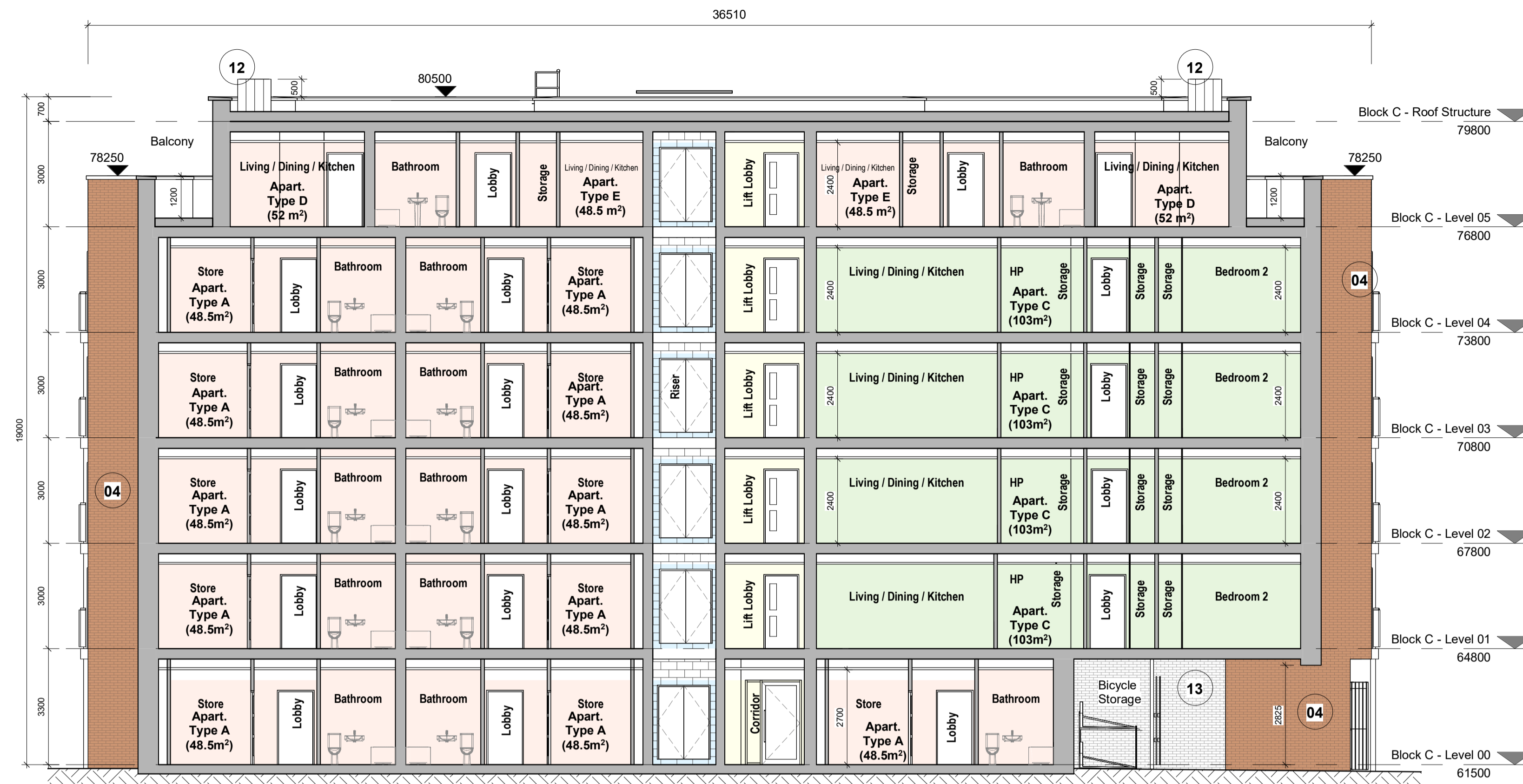
1 Block C - Section 01 1 : 100