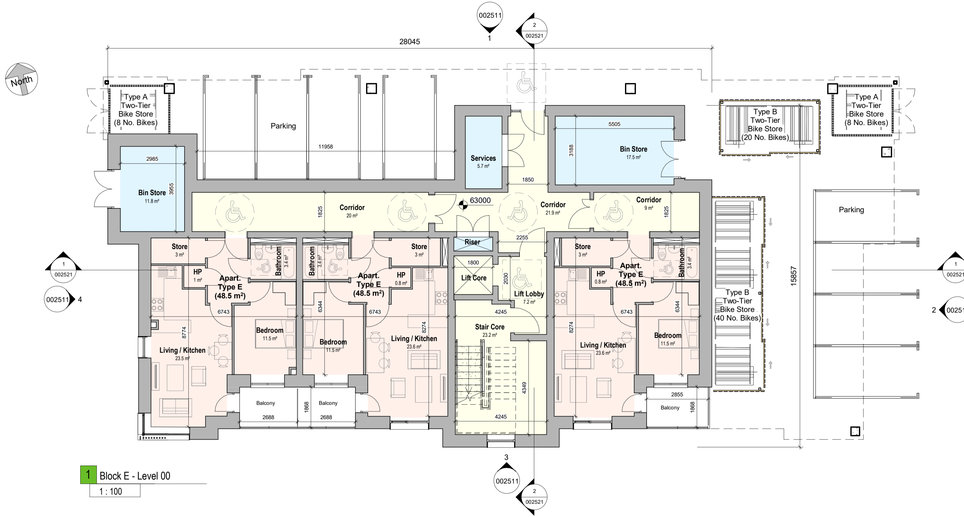
1 Block E - Level 00 1:100