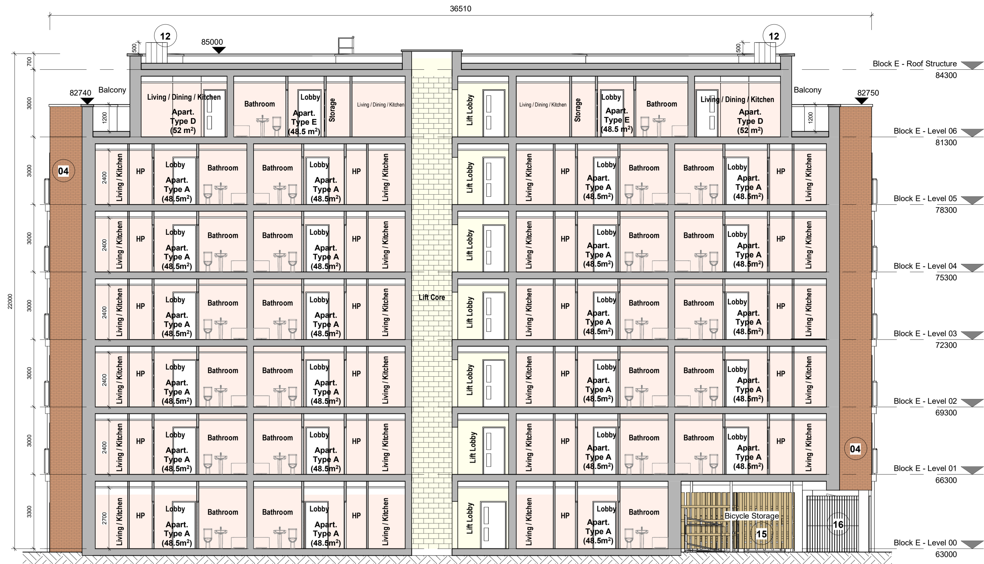
1 Block E - Section 01

NOTE: All materials to be approved prior to construction