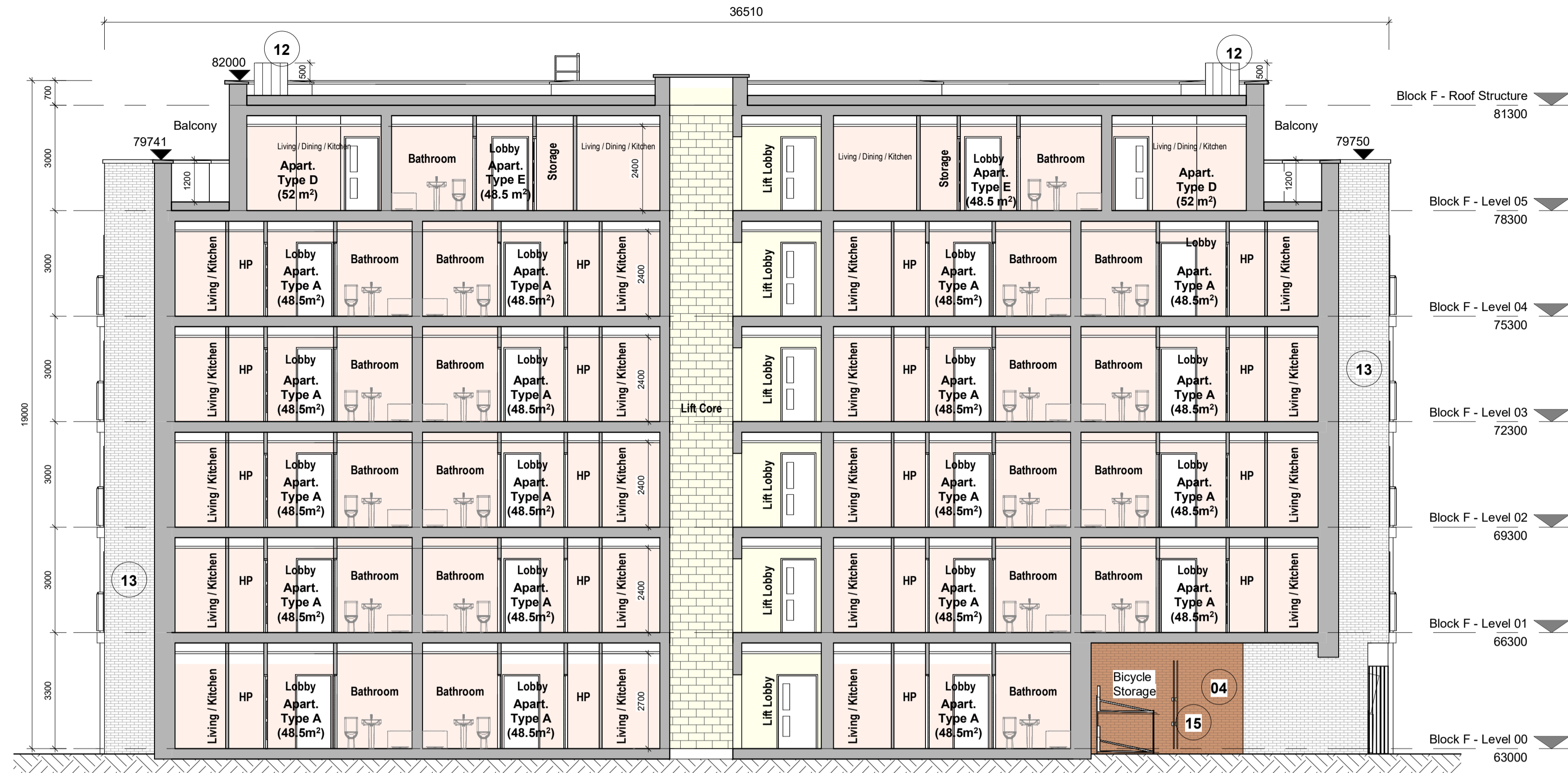
1 Block F - Section 01 1 : 100