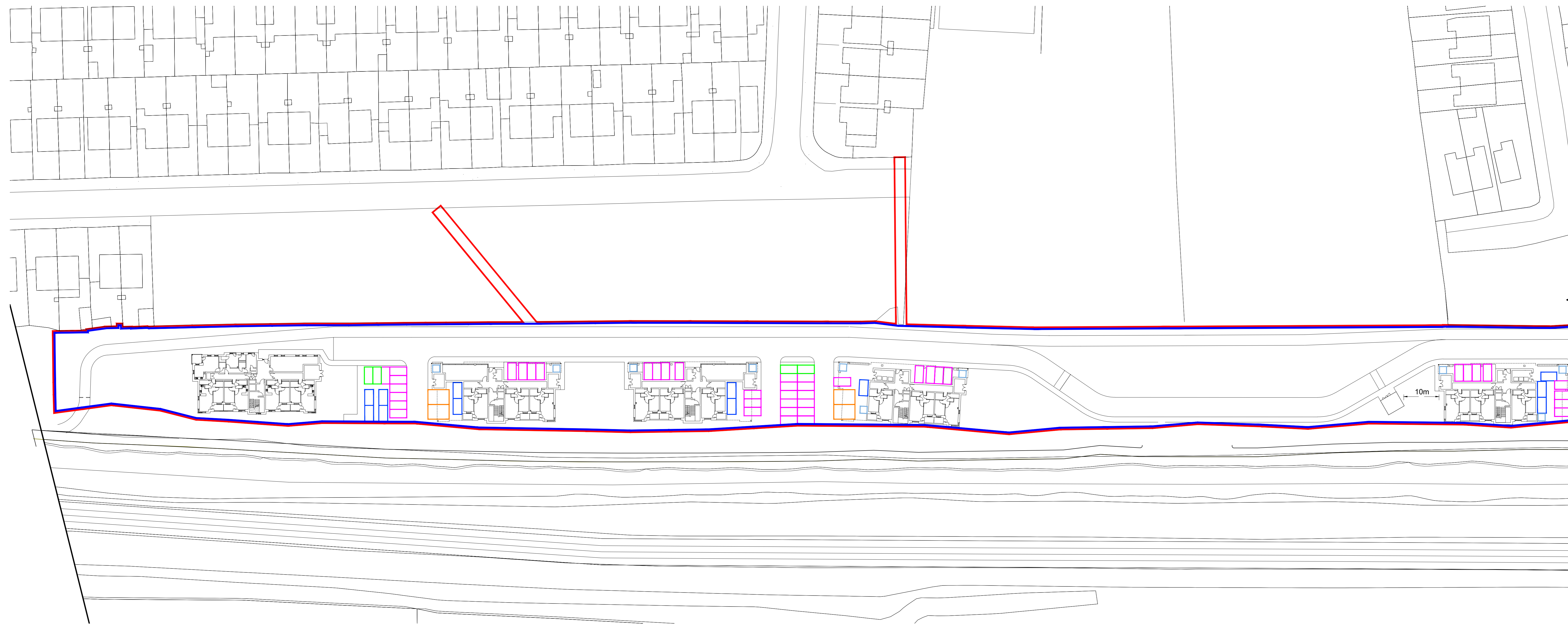
1 Proposed Site Layout Plan - West end 1:500