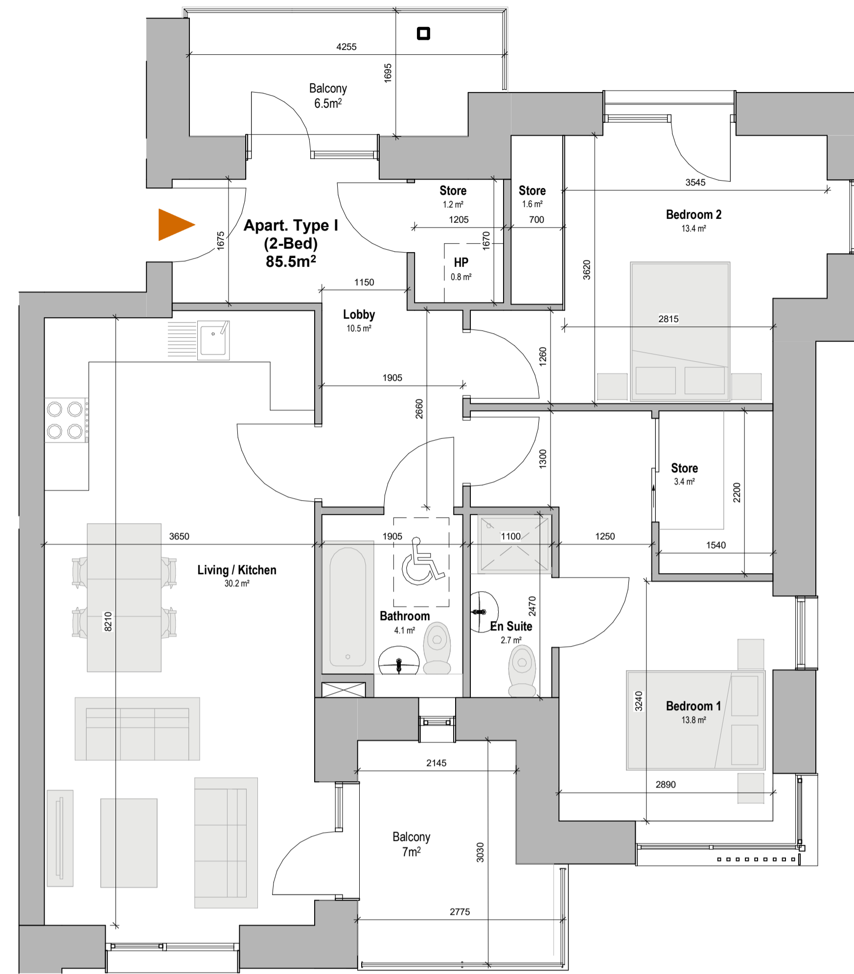
1 Apartment Type I 1 : 50